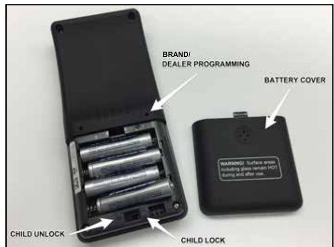
Figure 1. Install Batteries & Child Safety